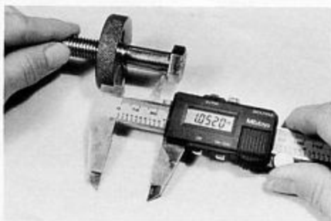
Figure 3. Measuring " L_G max" with non-counterbored Go ring gage and caliper.

The L_B , referred to as L_B min in Table 4B, is defined in paragraph 11.4 as the distance from the "last scratch of thread or top of the extrusion angle" to the cap screw's bearing surface. Table 4B lists the requirements for "Full Threaded" cap screws. Other cap screw L_B min. requirements are calculated by subtracting the Y listed in Table 4 from the measured L_G of the cap screw being measured. Following our 1/2-13 X 2-1/4" cap screw example, this pictured part would be rejectable if its L_B was